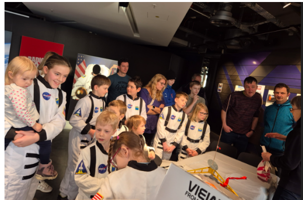
Astrokids in action